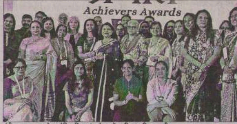
चंडीगढ़। शुक्रवार को आयोजित शिखर सम्मेलन में उपस्थित महिला उद्यमि