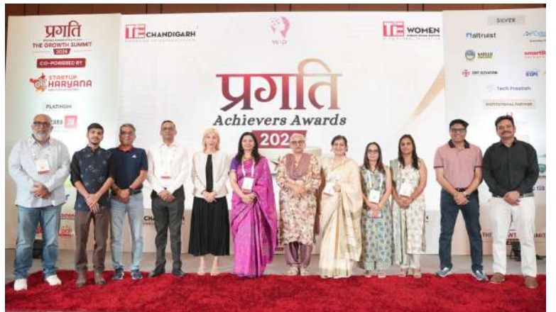
One of the most anticipated segments of PRAGATI 2026 was the PRAGATI Awards Ceremony , a celebration of excellence, resilience, and achievement by women who have made remarkable contributions across entrepreneurship, business, leadership, education, healthcare,